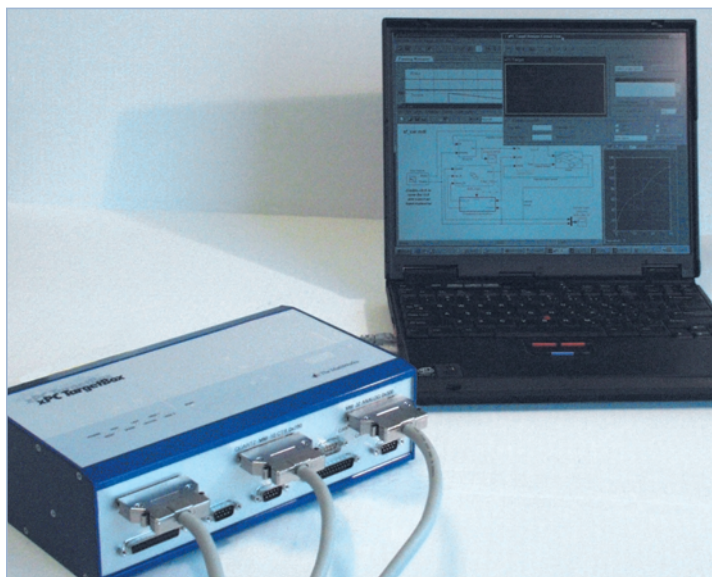
xPC TargetBox connected to laptop running Simulink and Stateflow for rapid control prototyping application.