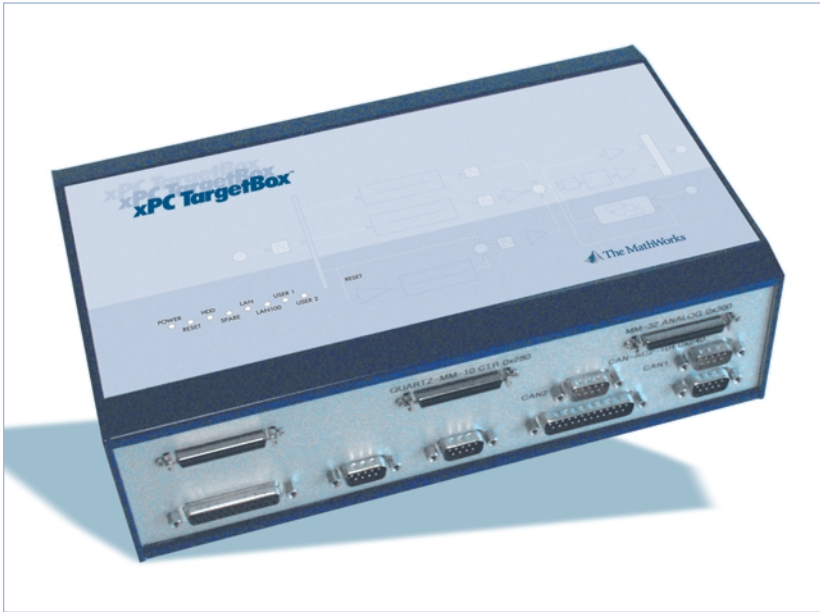
xPC TargetBox is an integrated, rugged system with complete I/O connections for use in an office, lab, or field environment.