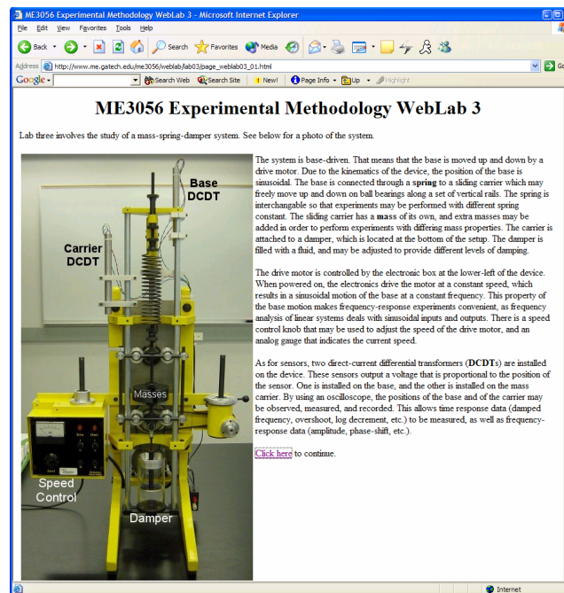
Figure 3: Mass-Spring-Damper WebLab – Apparatus Information Only

The URL for the WebLab may be found in the bibliography. 3